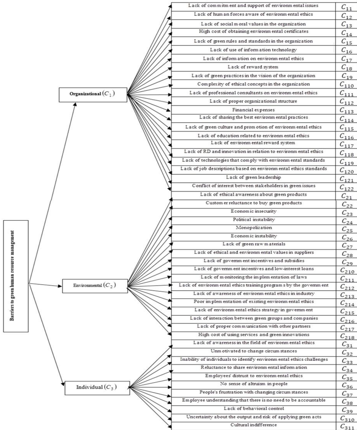
Fig2: Hierarchical graph of ethical barriers in green human resource management