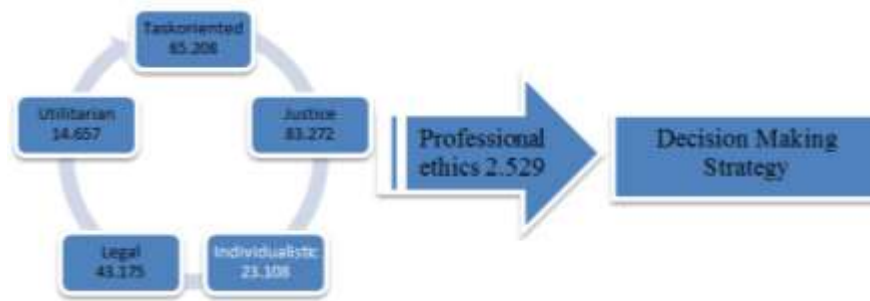
Fig. 3. Results of SEM fitness and the absolute t-values of paths